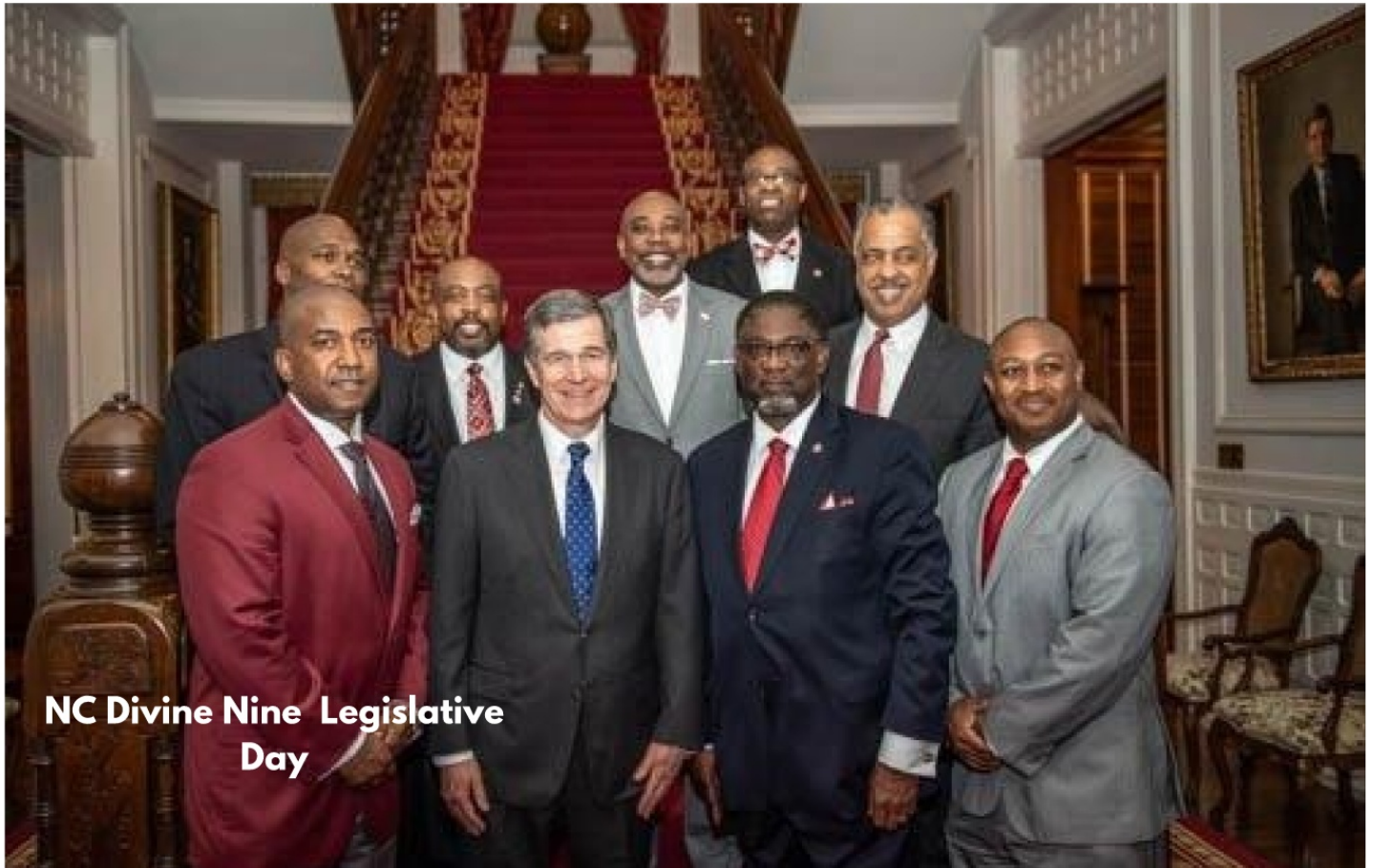
NC Divine Nine Legislative Day