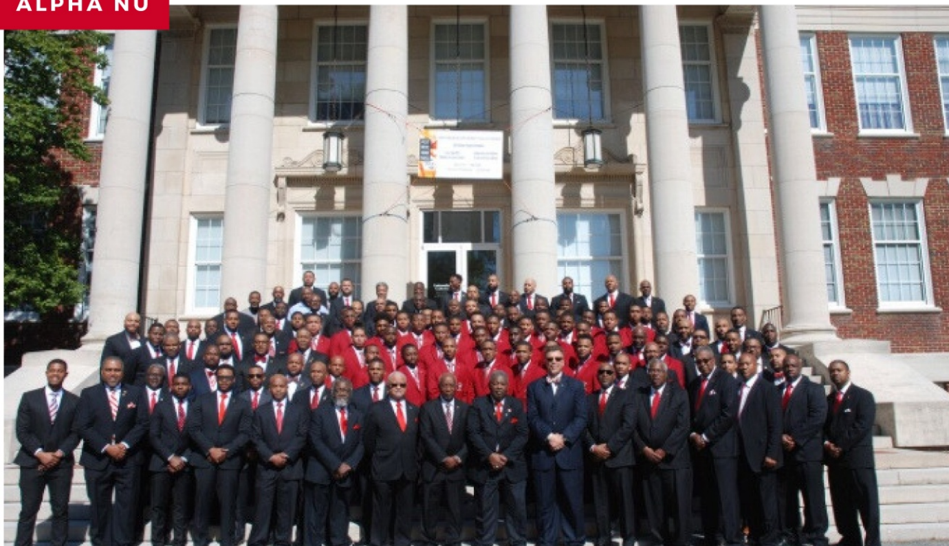
(Current Alpha Nu Chapter and alumni photo take on the steps of the Dudley Building of North Carolina A&T State University, during the 3rd Annual Alpha Nu Retreat.)